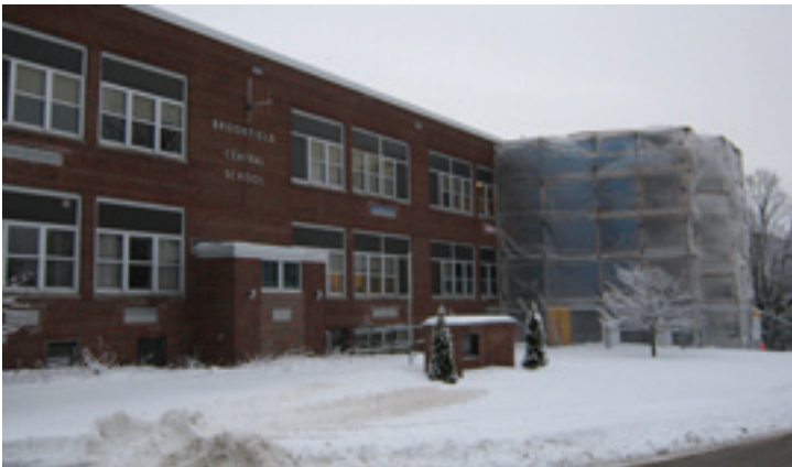
Brookfield Central School is a consolidated school district in rural central New York. The gym rehab occurred during the late winter/early spring.

Situation: Brookfield Central School in Brookfield, NY underwent a complete gym rehab recently. This included a new wood floor, lights, wall padding, basketball backstops, painting etc. The gym bleachers were removed prior to commencing work and relocated to a temporary storage trailer. The Bleacherman refurbished the understructure, painted the decks and installed new wood seats and risers. Now the gym is completely refurbished from top to bottom.