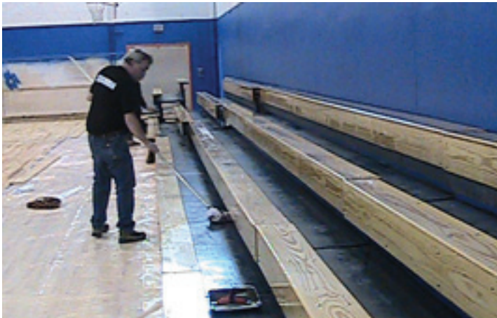
A bleacherman is applying the final coat on the decks. These sections have been reattached to the wall. Note the plastic drop cloth protecting the new floor.