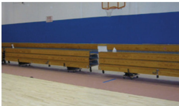
Bleacher sections on dollies in the gym, prior to beginning work on the bleacher understructure.