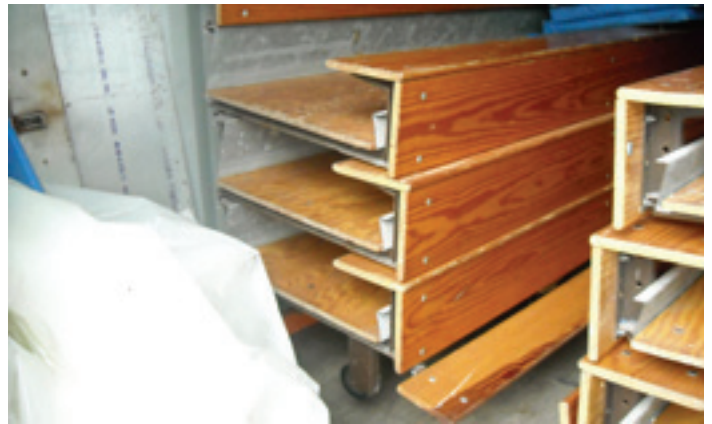
Four-row high Hussey® telescopic bleachers were removed from the gym and stored prior to commencing work on the gym floor refurbishment.