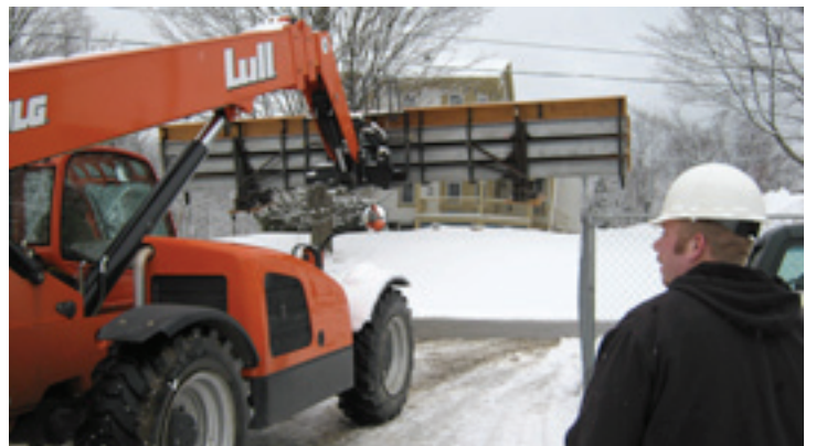
Bleachers were removed from storage and relocated to the gym, one section at a time. The Bleacherman works year-round to accommodate school schedules, regardless of weather conditions.