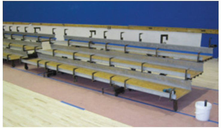
Here the closed decks are being cleaned and sanded in preparation for painting. Two applications of floor & deck enamel are applied to the existing plywood decks.