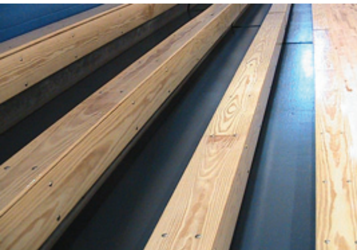
New wood complements the new gym floor. Painted decks in a contrasting color help people with limited depth perception to enter and exit the bleachers. New hardware completes the look for an "as-new" appearance.