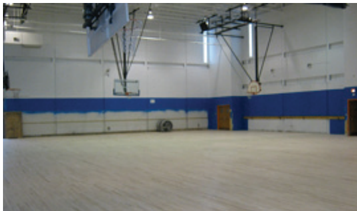
Picture shows the total renovation of the gym in process. Walls are partially painted, the floor was recently installed, but not finished.