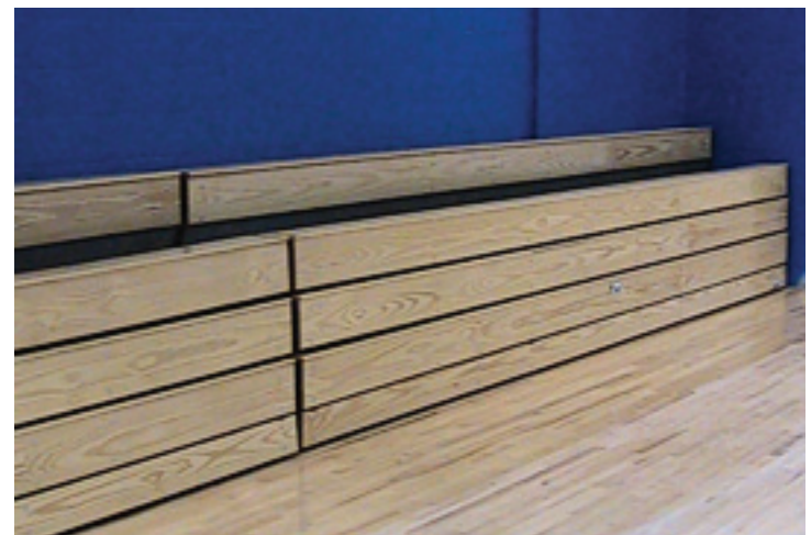
The refinished bleachers in the full closed position. Note the even row spacings -- these bleachers look brand new, and work that way too.