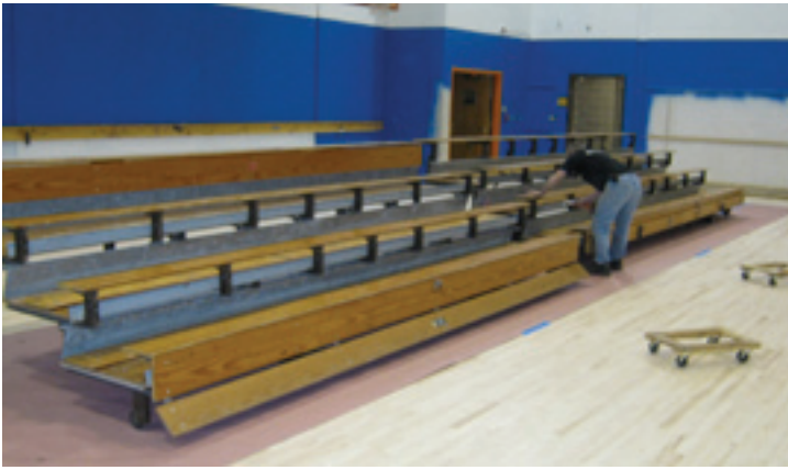
Here the bleacher section has been lifted off the dollys, and removal of old lumber has begun. This provides easy access to the closed deck system.