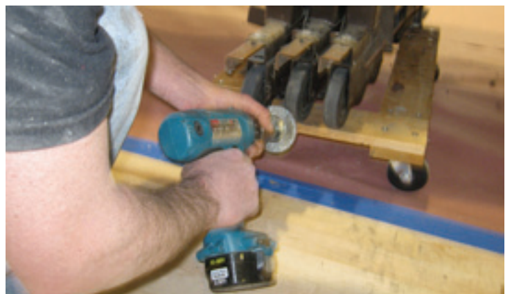
Picture shows a bleacherman cleaning bleacher wheels with a wire brush, to make sure they are clean and free from debris, before they touch the new gym floor.