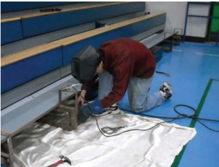
Some welding is required to reattach a wheel.