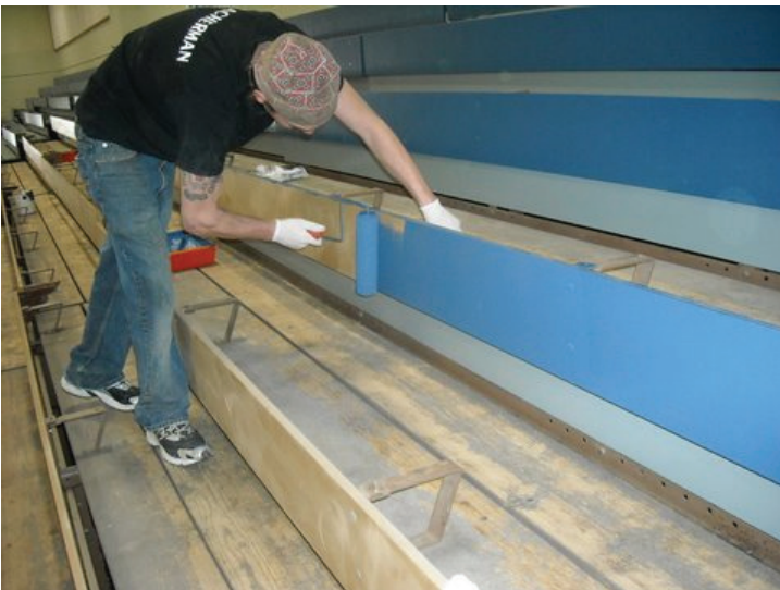
Risers were refinished in the school colors. Footboards and heelboards were refinished in a neutral gray.