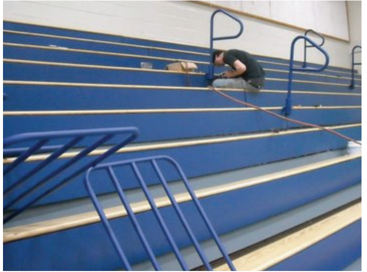
Installing the self-storing P-rails and safety rails.