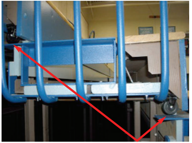
A better view of seat-level Century Design® system in the full open position.