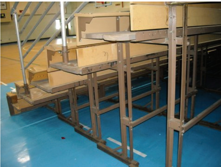
The understructure was repaired and serviced. And demountable safety rail and holders removed.