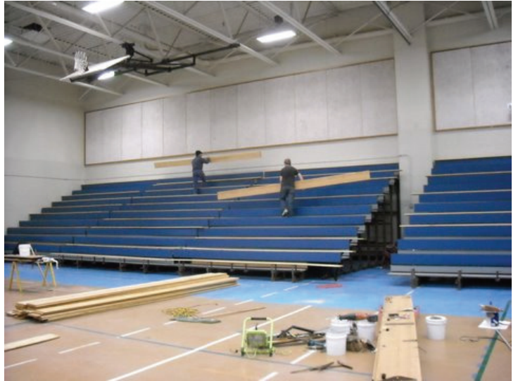
After being planed, edged, sanded and receiving two coats of approved sealer, seatboards are returned and set in place