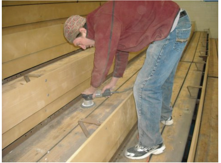
The seatboards were removed and sent to Bleacherman's facility for planing and refinishing. The footboards, heelboards and risers were sanded in place to remove old paint.