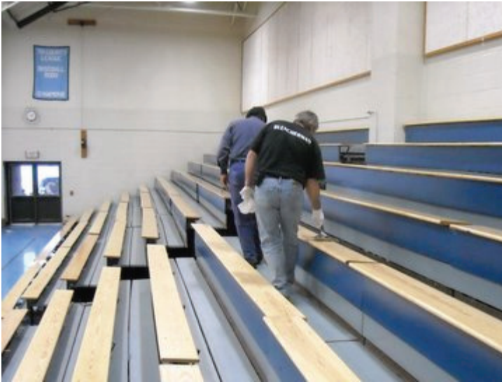
A high-build coat of polyurethane clear sealer is applied before the seatboards are attached. Worker in front applies sealer with a roller, following worker removes bubbles.