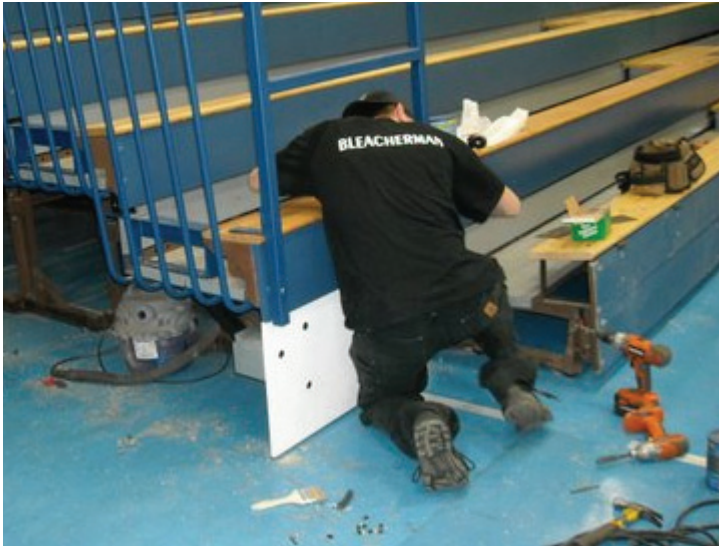
Bleacherman worker installing an ADA “cutout” to accommodate wheelchair seating.