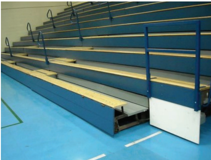
Now Franklin County Technical School’s bleachers are ready for more decades of service.