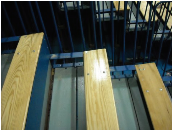
Refinished surfaces and new hardware provide an “as new” look.