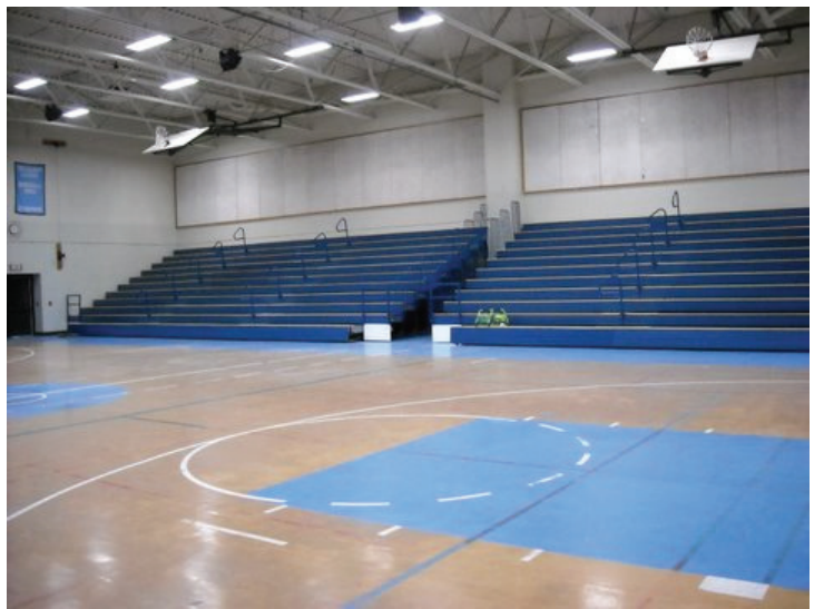
Savings for the school district versus buying new bleachers was 20 percent.