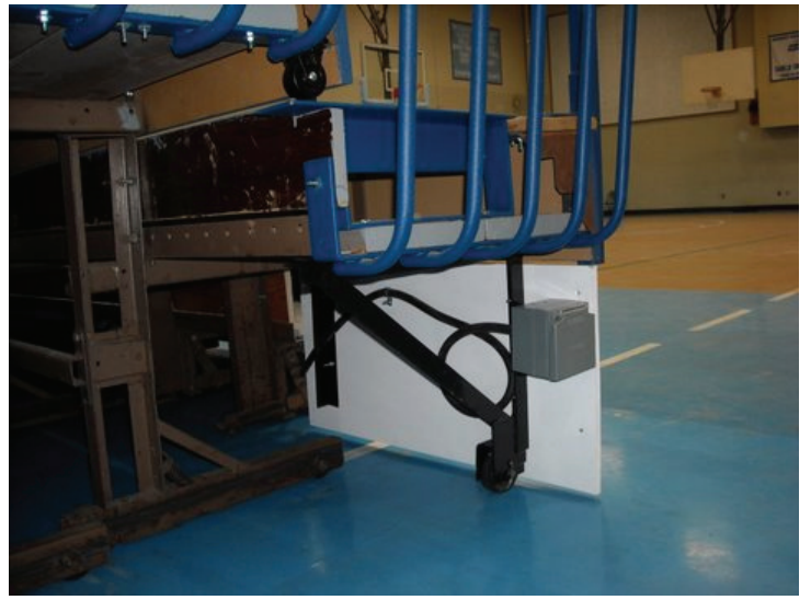
This is the 110v “plug-in” unit for the pendant controller. Unless the controller is plugged in to the wall outlet and the bleachers, there is no live wiring underneath the bleachers.