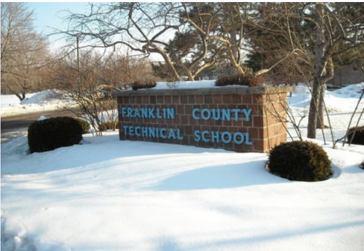
Franklin County Technical School is located in Turner Falls, Massachusetts.