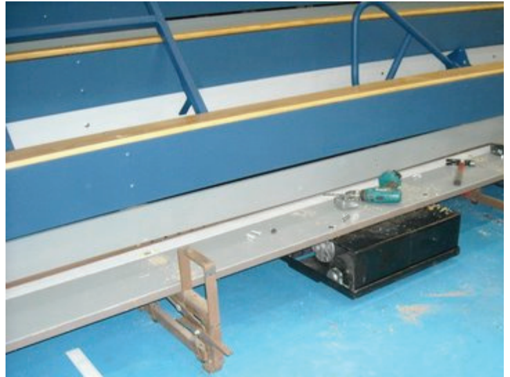
Heavy-duty 350 lb. motorized drive unit(one of two) is attached to the second row footboard.