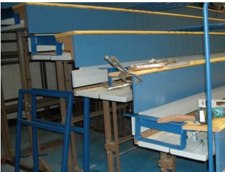
The Century Design® system is installed, so the telescoping bleachers cannot sag in the future.