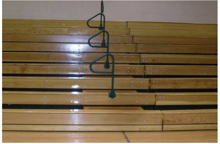
Seat level aisles and self-storing “P” rails help prevent trip and fall accidents from happening, by providing safer ingress/egress to bleachers.