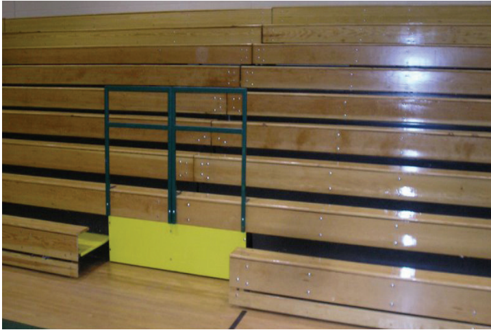
First row cut-out provides ADA compliance for wheelchair spaces with companion seats.

Original lumber was removed while the understructure was unfastened from the wall and re-aligned (to remove gaps). Wood was sorted and grouped by type and species. Then all boards were planed, edged, sanded and stained to match. After two coats of sealer, boards were hand-sanded, then re-installed with new hardware prior to final coat of sealer. All wood refinishing was done on-site.