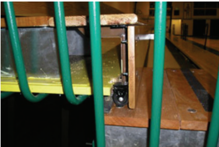
Century Design® system prevents sagging. End aisles (or intermediate aisles) provide continuous support for the Century Design® wheel.