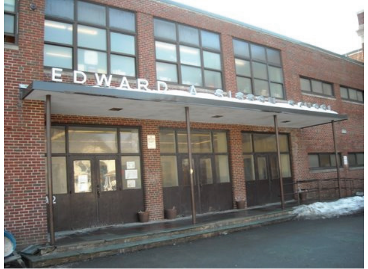
Edward A. Sissons School in Lynn, Massachusetts

New England was the latest stop for the 2009 “Keep Gym in School” program, bringing excitement and $50,000 in grant money to Pickering Middle School. With partners the New England Patriots and Verizon FiOS TV, NFL Network celebrated the adoption and refurbishments in Lynn, MA with a high-energy pep rally and minicamp. The grant money provided funding to convert a run-down locker room into a state-of-the-art fitness room with new cardio and weight training equipment. The grant was also used to provide additional Physical Education equipment and inspired the City of Lynn to provide funds to renovate the gymnasium including refinishing the gym floor. With the improvements, more students will have more access to better facilities and more physical activity classes - including a dedicated weight training and exercise class to educate students on proper technique. Bleacherman handled the bleacher removal and re-install of new Evergreen Bleachers™.