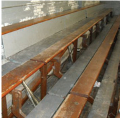
Large openings (between seatboard and footboard) present a safety hazard.