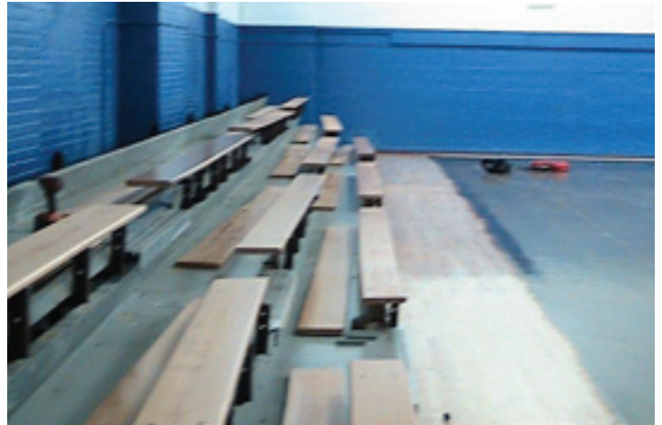
Remounting the fir seatboards after reconditioning. Note the before-and-after difference of the bleacher boards and the gym floor.