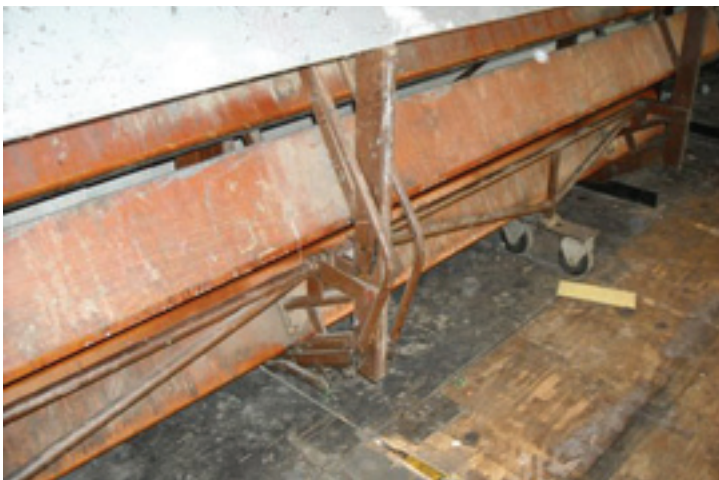
Old bleachers were manually folded up against wall. Note poor condition of gym floor.