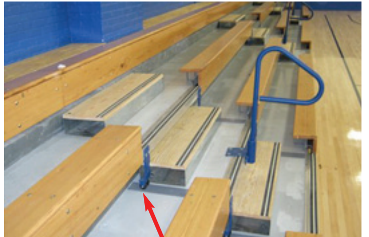
Foot-level Century Design® “no-sag” system reinforces the new bleachers, comes with a 20-year warranty. Intermediate steps with non-skid tape are code-compliant.