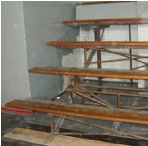
No safety rails, no aisles, Note walls and floor need refinishing.