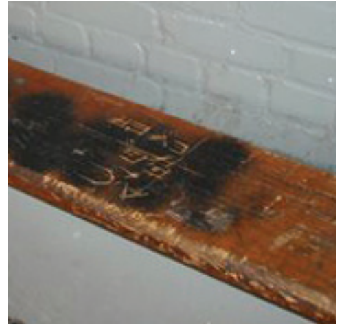
Fir lumber was solid 1.5” X 10” -- Years of wear and tear, plus vandalism, made it unsightly (but restorable).