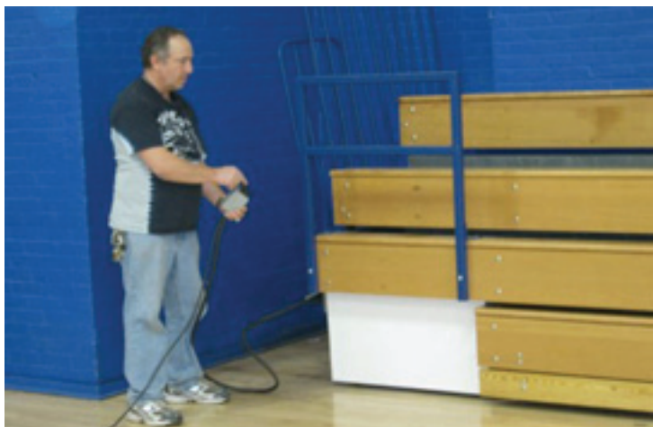
Another safety feature: bleachers have no live wiring underneath. Drive system is energized only when the operator plugs in the pendant controls to the nearest wall outlet to open or close bleachers.