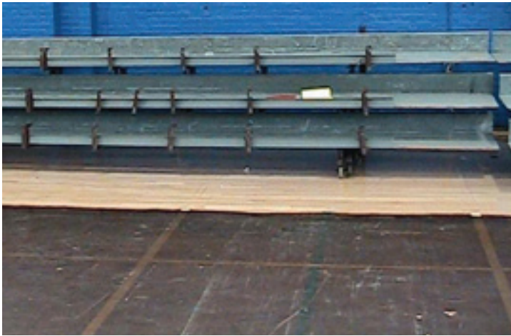
Old “slant-style bleachers were removed, then the area beneath the bleachers was sanded and sealed, prior to installing the new bleacher understructure.