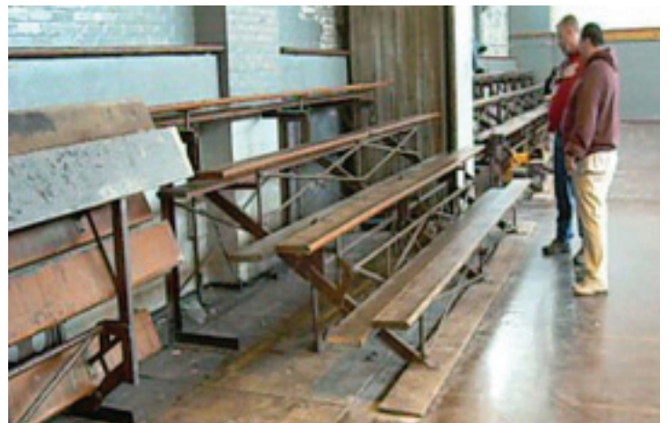
Old (60 - 70 years) slant-style bleachers cannot be made to conform with building and safety codes.